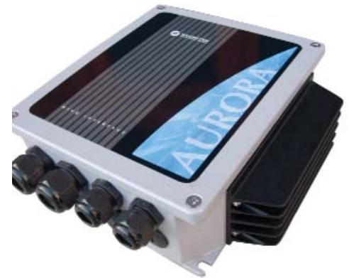
Optional Wind Interface Box